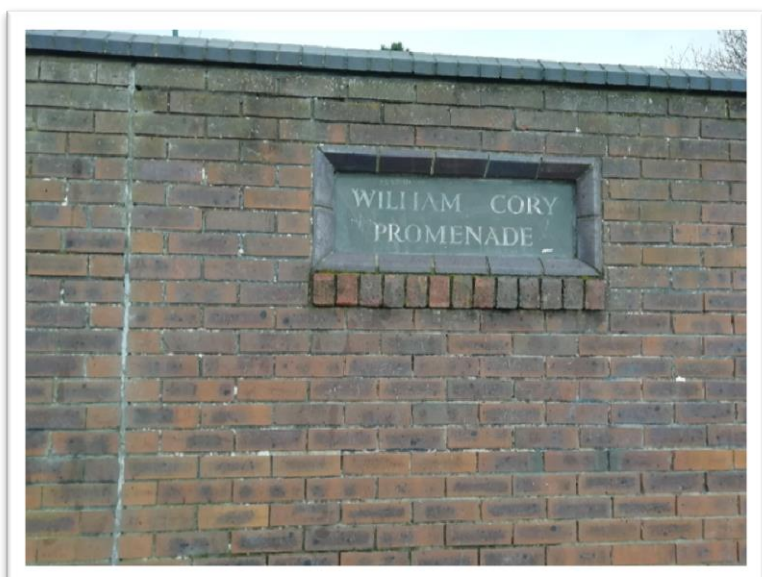
Figure 4 - 6 Examples of Current History and Heritage Signage

signage and markers relating to Alexander Selkirk, an Erith Heritage Town Walk and the donation of land by William Cory.