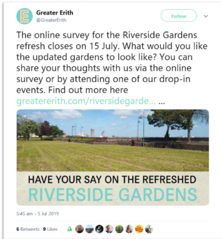
Figures 3 -3 Examples of Project Comms