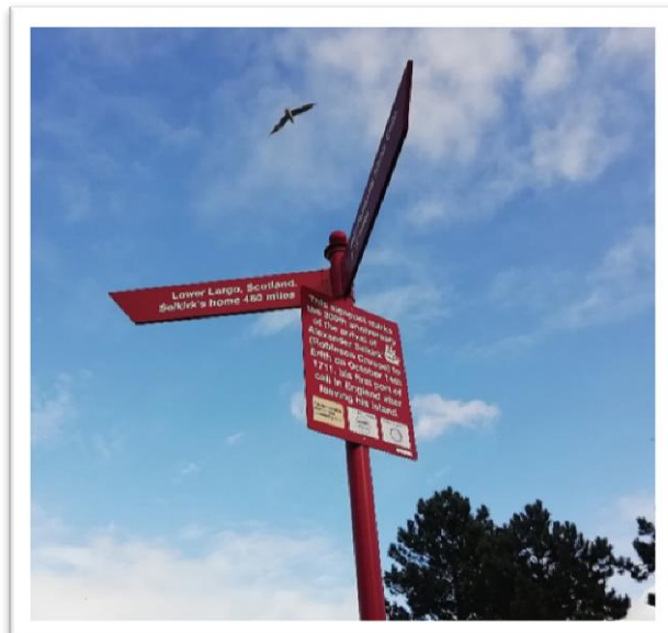
Figure 4 - 6 Examples of Current History and Heritage Signage