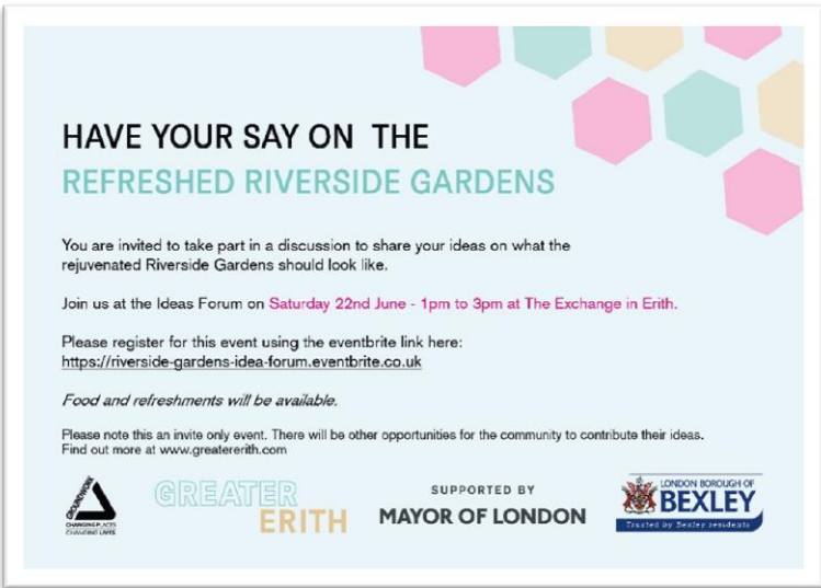
Figures 2 -3 Examples of Project Comms

Throughout the first stage we have been using a mixed comms approach to different stakeholders, this has included direct communications such as emails and phone calls as well as leaflets, posters, business cards, project signs, e-invites, updated website and regular social media posts. Below is an example of some of the communications we have produced.