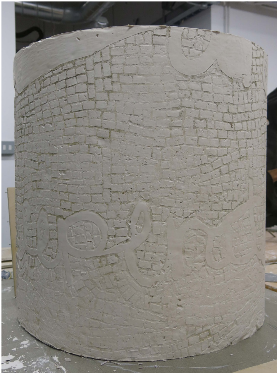
Casts 1:1 Earth Core columns designed for Erith reflecting the layers of earth and passing of time