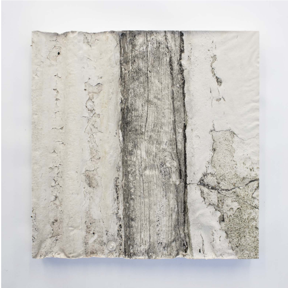
Casts 1:1 Remaining timber framed Industrial building, with its corrugated cladding